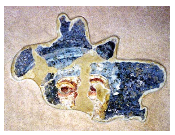
Agapitus I (535-536) traveled to Constantinople, Fig. 2. Fragment of the 6th century fresco painting from the Large Basilica. (R. Mihajlovski)

incorporated in its former diocese of Thessalonica, which was under Papal authority until 732/33.15 Some of the Roman Popes and their legates traveled to Constantinople over the Via Egnatia in the centuries when Constantinople and Rome were one Christendom. In 515 and 517 Pope Hormisdas (514-523) sent his embassy to Constantinople, and Pope eled to Constantinople. on 22 April 536. 16