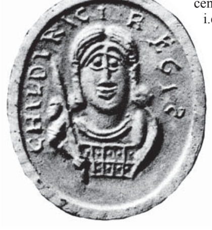
Fig. 1 – Ring of Childericus, Tournai Сл. 1 – Хилдериков прстен, Tournai

8.15 g), housed in the National Museum in Niš (Inv. 110/B), consists of circular band hoop and conical head shaped as oval setting placed above the hoop line (Fig. 3). On the top surface of the head is deeply engraved male image in profile, facing left. Although the face features are schematized, still large eve. long, straight nose, large mouth and strong mandibular bone could be noticed. The hair is combed from the top of the head towards the forehead, which is completely covered with thick locks. On the head is a diadem depicted by the line separating the hair from the face; it is tied on the back of the head and its