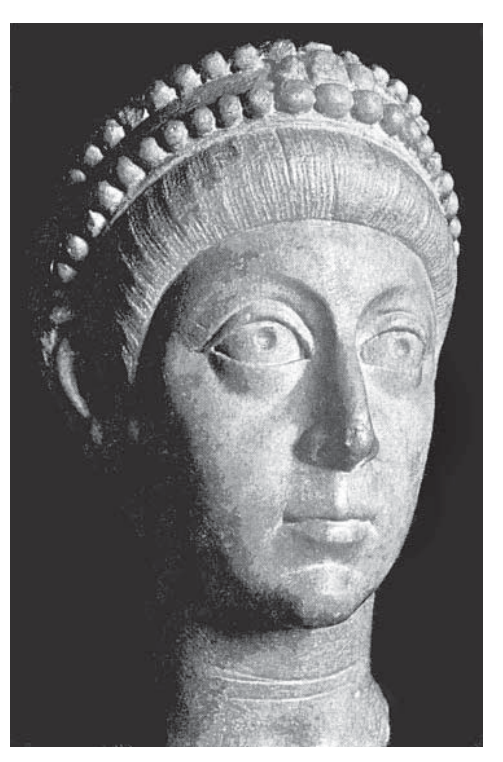
Fig. 6 – Portrait of Arcadius, Archaeological Museum, Istanbul Сл. 6 – Аркадијев портрет, Археолошки Музеј, Истанбул