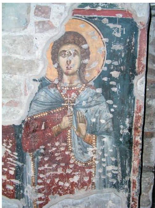
Сл. 3 Св. Кузма, Црква Св. Алимпија.