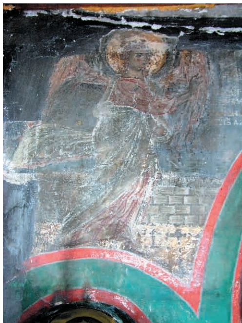
Сл. 2 Арханђео Гаврило, Благовести, Црква Св. Алимпија. Fig. 2 Archangel Gabriel, the Annunciation, Church of St Alypios