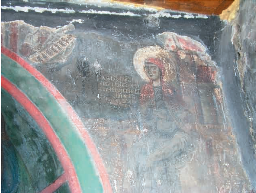
Сл. 1 Богородица, Благовести, Црква Св. Алимпија, Касторија