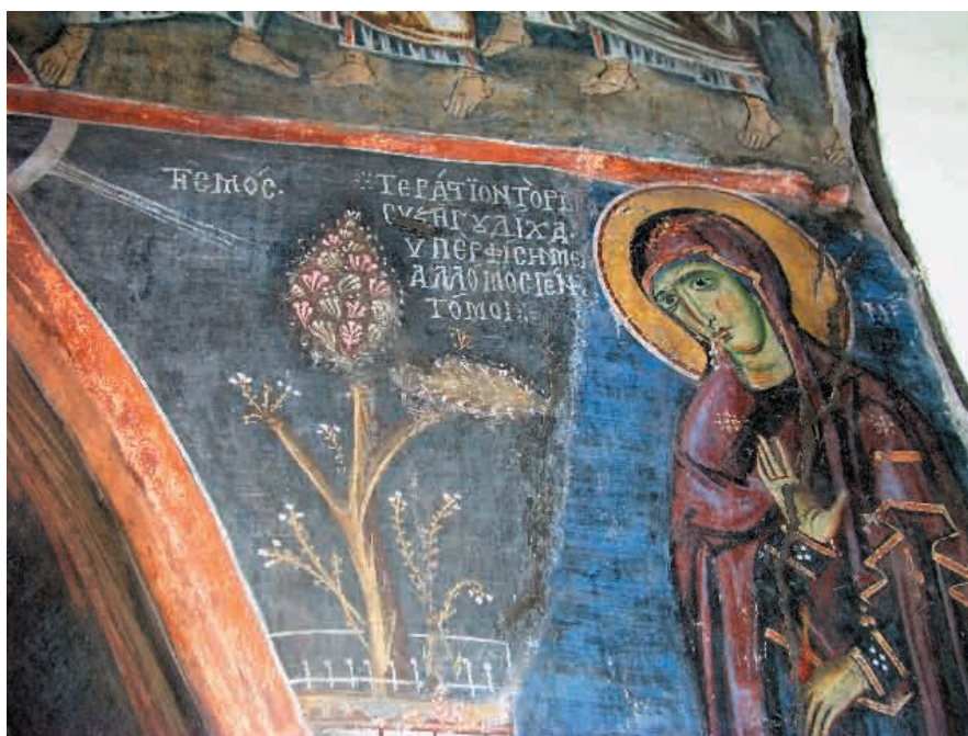
Сл. 5 Богородица, Благовести, Црква Богородица Мавриотиса, детаљ