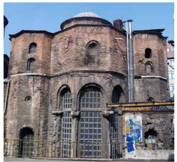
Fig.2. The northern Church of the Convent of Lips, Constantinople, Сл.2. Северна црква манастира Константина Липса у

And what accentuates this paradox is that he actually "saw" those narrative snippets of everyday life, habits, and beliefs. The phenomenon that this instance exemplifies is the manifestation of a narrative that is miss ing , which, in turn, is substantiated, through visual artifacts. Do artifacts, then, tell stories (fig.4)? What I wish to explore and theorize here is how con sumers/ beholders make sense and experience absent narratives through visible images on the walls of Byzantine church (fig.5)