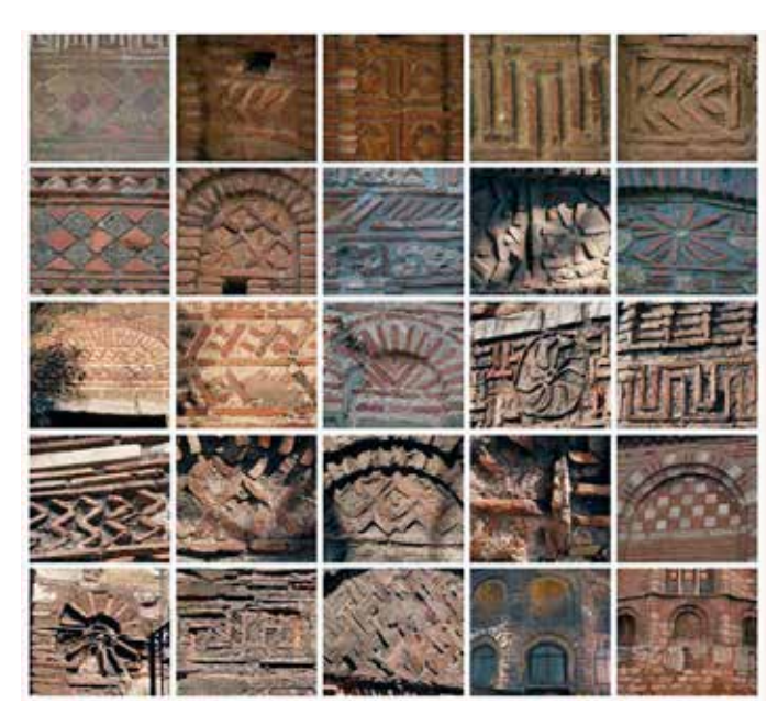
Fig.5.Collage of brickwork images on the apse of the souther Church of the Convent of Lips, Constantinople

Сл.5. Колаж орнамената изведених опеком на апсиди јужне цркве манастира Константина Липса, Цариград