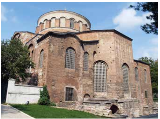
Fig.1. The Church of Hagia Eirene in Constantinople

Сл.1. Црква Св. Ирине у Цариграду