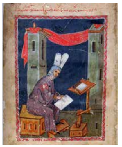
Fig.3. Niketas Choniates, Historia (Constantinople?, 14th-c.), Wien, Österreichische Nationalbibliothek, Cod. Hist. gr. 53*, fol. 1v

Сл.3. Никита Хонијат, Историја (Цариград?, 14. век), Беч, Аустријска национална библиотека, Cod.Hist.