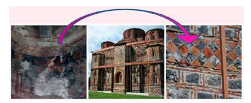
Fig.7. Left: painted chess fields in the apse of the Church of the Virgin Mary Paregoritissa in Arta, right: brickwork chess fields (opus reticulatum) on the apse of the Virgin Mary Paregoritissa church in Arta

Сл.7. Лево: осликана шаховска поља у апсиди цркве Богородице Паригоритисе у Арти; десно: орнамент шаховских поља (опус ретицулатум) на апсиди цркве Богородице Паригоритисе у Арти