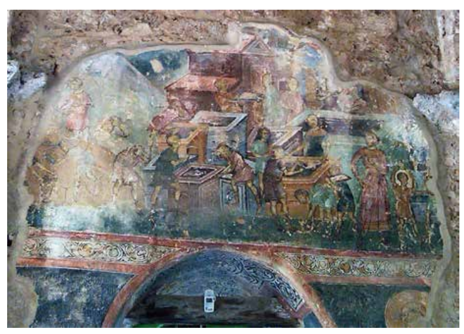
Fig. 1 The Parable of the Rich Fool, the exonartex of Sopoćani, west wall, 1343. Сл. 1 Парабола о Безумном богаташу, спољашња припрата Сопоћана, западни зид, 1343.

es workers building the temple, not mentioning any other data. <sup>4</sup> He interprets the inscription "vasta" as the name of the architect, and he also mentions the inscription "agonisa(n)te," still without any further explanation.<sup>5</sup>