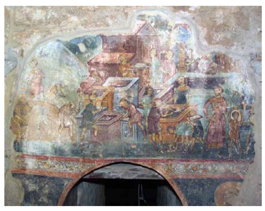
Fig. 2 The Parable of the Rich Fool, the exonartex of Sopoćani, west wall, detail, 1343. Сл. 2 Парабола о Безумном богаташу, спољашња припрата Сопоћана, западни зид, 1343.

IND (?)...| ... MOEN AUE ... MK , which is important because the inscription is not readable today.<sup>10</sup> However, he does not resolve it but makes a conclusion that it comes from the 19<sup>th</sup> verse of the account from the Gospel of Luke.<sup>11</sup>