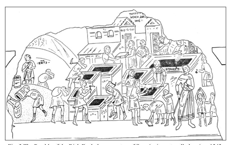
Fig. 3 The Parable of the Rich Fool, the exonartex of Sopoćani, west wall, drawing, 1343. Сл. 3 Парабола о Безумном богаташу, спољашња припрата Сопоћана, западни зид, 1343.

Apart from these observations, no further attention has been paid to the fresco of the parable of the Rich Fool, nor has any study been dedicated to it. As a unique example of this theme in Serbian medieval art, this fresco in certain way makes up for the general state of preservation of the wall painting of the exonarthex in Sopoćani and shows that there is still room for the analysis of certain themes in the programme of this area. Therefore with the aim of establishing the reasons for depicting of this fresco in the given spatial unit, we will examine the iconography of the said composition, its position in the exonarthex, programmatic placement in the broader scope of the given space and finally the interpretations of this biblical story by Byzantine and Serbian medieval writers. However, before that, we will first have a glance at the whole programme of the Sopoćani's exonarthex, by briefly stating the themes present in the wall painting of this area.