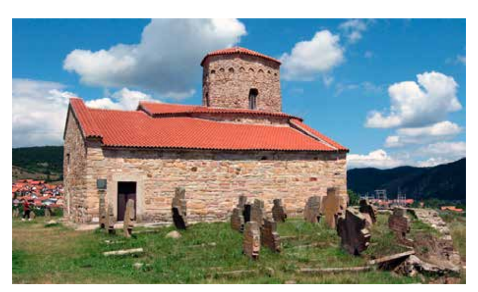
Fig. 3. The church of the Apostles Peter and Paul, Ras.

Сл. 3. Црква Светих Апостола Петра и Павла у Расу