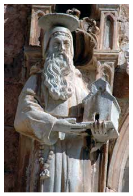
Fig. 5. St Blaise, patron of Dubrovnik. Statue with modern restoration showing saint as protector of the city's cathedral.