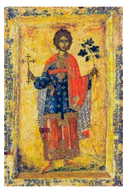
Fig. 4. St Tryphon, patron of Kotor. Undated icon said to be Greek but in the Serbian style showing the saint with vine cutting.

To Dubrovnik (Ragusa) came St Blaise (Fig. 5), as a compromise patron when the Greek and Latin Christians vetoed each other's saint – Sergius and Bacchus respectively. Blaise's head reliquary is said to have come from Byzantium in 1026, and there is also a hand relic of the saint.<sup>8</sup> However, chroniclers of the city such as Rastic and Ranjina attribute his veneration to a vision in 971 to warn the inhabitants of an impending attack by the Venetians, whose galleys had dropped anchor in Gruž and near Lokrum. Blaise was believed to be a bishop of Sebastea in Armenia (modern