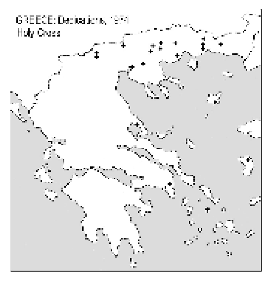
Objekti posvećeni Časnom krstu, Grčka, 1974. (ucrtao autor)

Dedications in honour of the Holy Cross, Greece, 1974 (by the author).