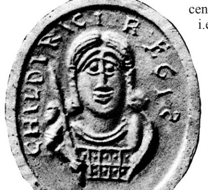
Fig. 1 – Ring of Childericus, Tournai Сл. 1 – Хилдериков прстен, Tournai

find from the end of 14<sup>th</sup>-beginning of the 15<sup>th</sup> century<sup>4</sup>, and then as Early Christian object,<sup>5</sup> i.e. the jewelry from the 4<sup>th</sup>-6<sup>th</sup> century.<sup>6</sup>