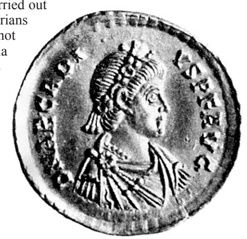
Fig. 5 Сл. 5